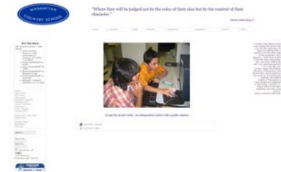
Manhattan Country school uses their site to publicize their school online.

There are many different CMSs available on the Internet. Joomla! Is 100% free. There is no download fee, upgrade fee, or support fee thanks to community support. Joomla! is licensed under GNU GPL v2 which creates an easier environment for schools to share customizations with other schools.