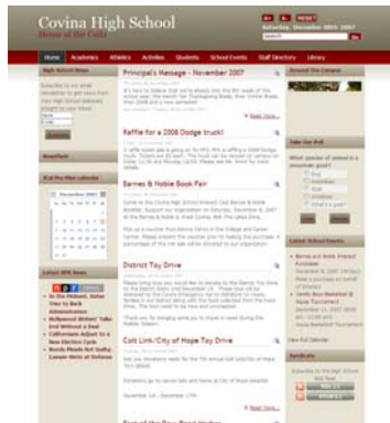
Covina High uses their site to post school news and events on their calendar.

Joomla! is a popular PHP based Content Management System (CMS). Joomla! can be used to easily create a variety of sites including school websites. Its limits do not end there! Joomla! has also been used to create personal sites, business sites, and hobby sites. Joomla!'s flexibility, extensibility, and ease of use allows users of all ages to create sites.