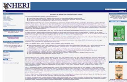
NHERI uses their site to promote home schools and present their research on schools.

There are thousands of extensions available at the Joomla! extension directory, extensions.joomla.org . Extensions are easy to install with Joomla!'s Extension Manager. These extensions were all created by the Joomla! Community for the community.