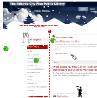
Atlantic City Free Public Library