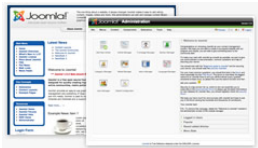
Screenshots of Joomla! 1.5 “Karibu”

The name Joomla! is the English spelling of the Swahili word jumla which is meaning “all together”. Joomla! is a C ontent M anagement S ystem (CMS) which originated from Mambo (another open source CMS).