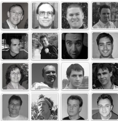
The Joomla! core team

Joomla! is mainly developed by the core team. The core team is responsible for the project management tasks. The core team currently contains sixteen members, and help move the development of Joomla! forward.